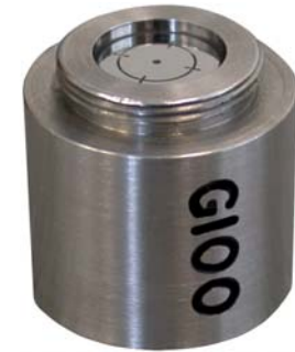
Precision certified calibration target

The camera is supplied with an adaptor for the standard PCS microscope. Camera calibration is done using a certified calibration target (supplied). The software also includes a facility for quickly checking the calibration if necessary.