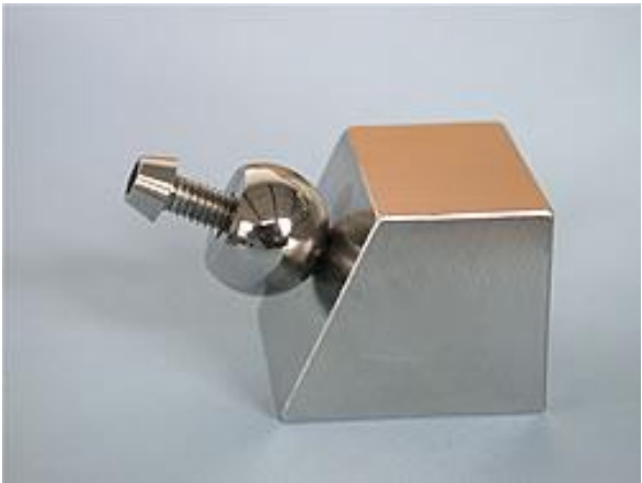
\frac{3}{4} " ball on holder and \frac{1}{2} " ball on holder