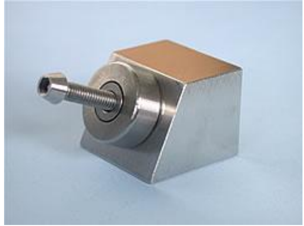
Microscope kit + a MTM steel barrel and adapter