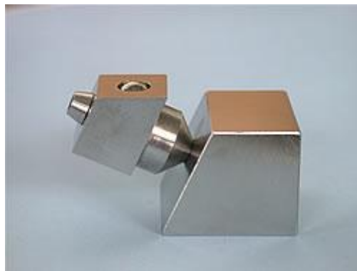
3 mm ball holder