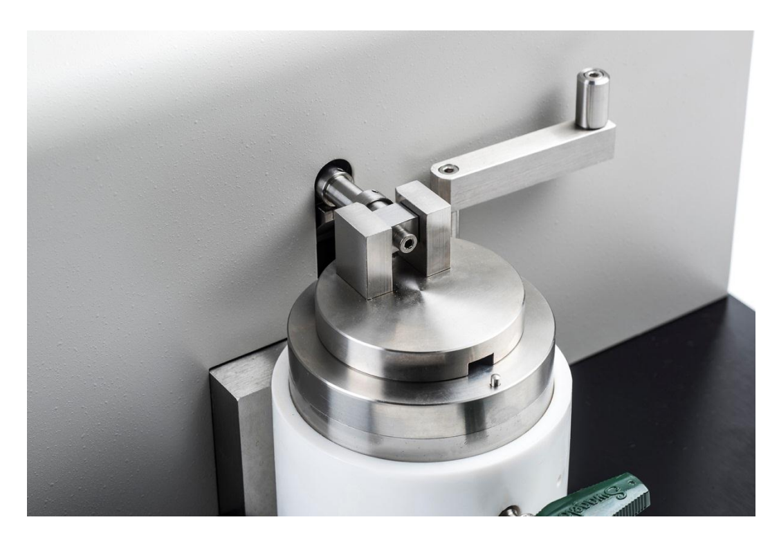
Figure 2: Alignment tool for POD