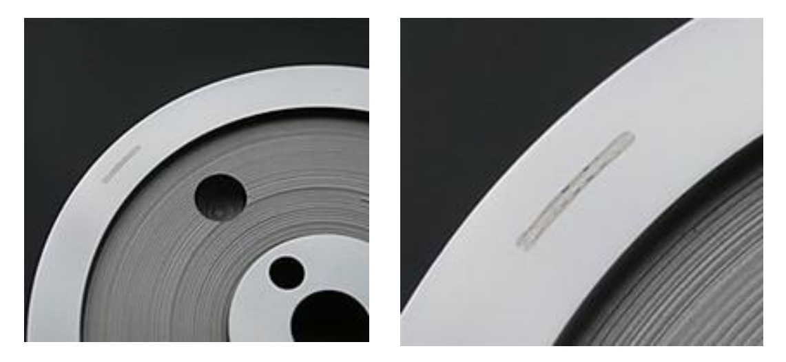
Figure 1: Scar on Disc (left) and Close Up (Right)

A typical example is simulating the motion found between a cam and follower.