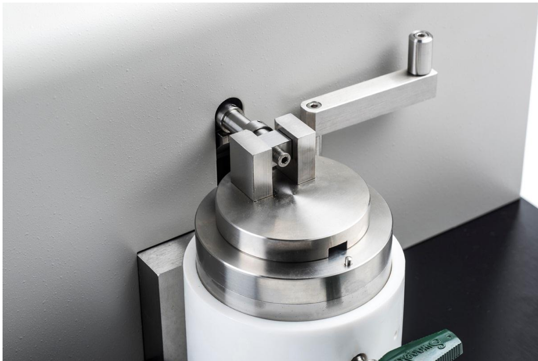
Figure 2: Alignment tool for POD